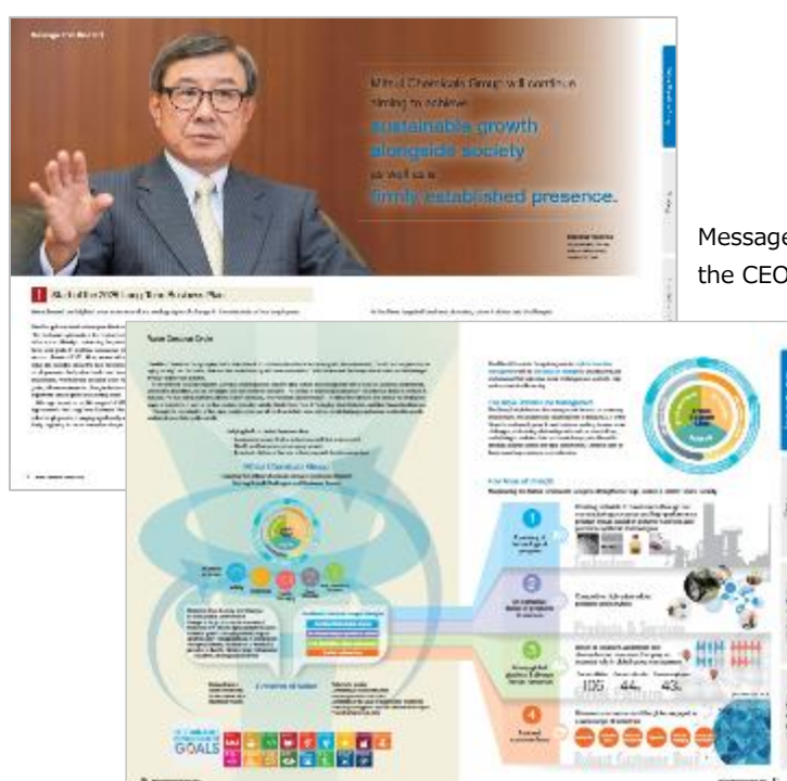
Message from the CEO