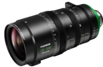
Standard zoom cinema lens "FUJINON Premista28-100mmT2.9"