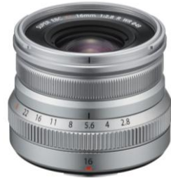
Interchangeable lens for digital camera X series "FUJINON LENS XF16mmF2.8 R WR"