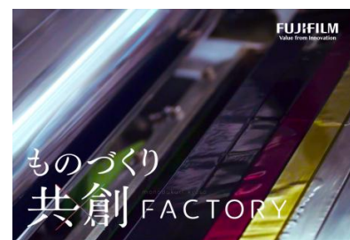
Materials Manufacturing Service "Co-creation FACTORY"

* Above list shows only 27 products, remaining 5 products yet to be released.