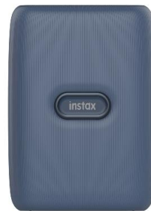
Smartphone printer “instax mini Link”