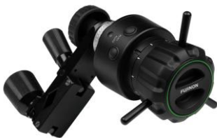
Focus position demand unit "FUJINON EPD-41A-D02" for broadcast portable lens