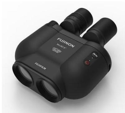
Binocular “FUJINON TECHNO-STABI TS-X 1440” [Good Design Best 100]