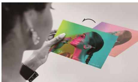
High precision lens film for inkjet printing "OperaPass"