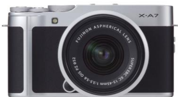
Mirrorless digital camera “FUJIFILM X-A7”