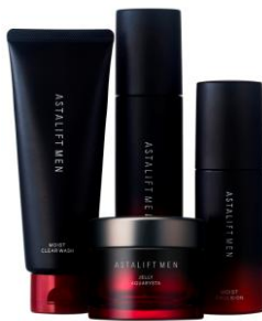
Skincare cosmetics "ASTALIFT MEN"