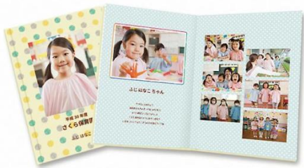
Internet photo album service “FUJIFILM School Photo – Graduation Album”