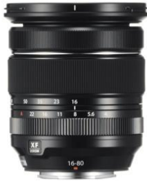
Interchangeable lens for digital camera X series "FUJINON LENS XF16-80mmF4 R OIS WR"