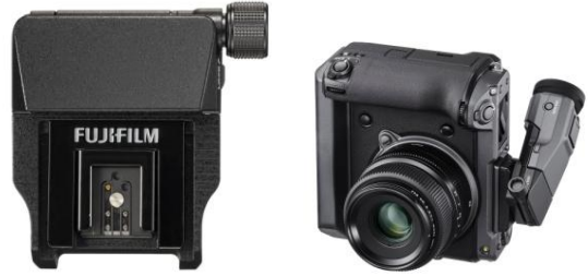
Attached to FUJIFILM GFX100 EVF tilt adapter for digital camera GFX series "EVF-TL1"