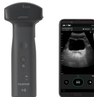
Ultrasound Equipment “iViz air” [Good Design Best 100]