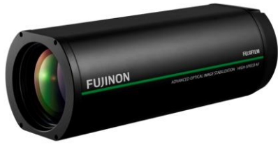
Long-range surveillance camera "FUJIFILM SX800"