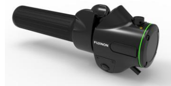
Zoom Rate Demand Unit "FUJINON ERD-40A-D01" for broadcast portable lens