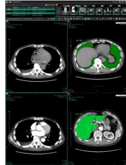
Medical Imaging Diagnostic Workstation "SYNAPSE SAI viewer"