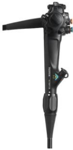
Endoscopes "G7 Series"