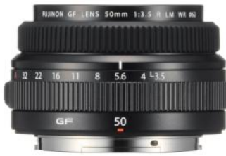
Interchangeable lens for digital camera GFX series "FUJINON LENS GF50mmF3.5 R LM WR"