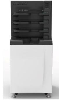
Computed radiography "FCR PROTECT CS Plus"