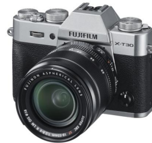
Mirrorless digital camera “FUJIFILM X-T30”