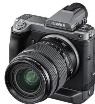
Mirrorless digital camera “FUJIFILM GFX100”