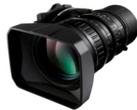
Broadcast portable zoom lens "FUJINON LA16x8BRM"