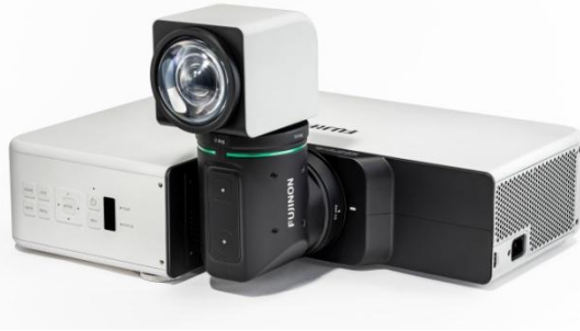
High-luminance, ultra-short throw projector “FUJIFILM PROJECTOR Z5000” [Good Design Best 100]