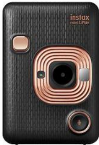
Hybrid instant camera “instax mini LiPlay”