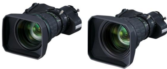
Broadcast portable zoom lens "FUJINON UA18x7.6BERD / UA23x7.6BERD"