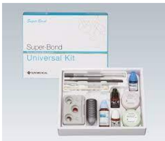
Image: Super-Bond™, now set to be sold in Brazil (actual product will differ from image.)

Employing 4-methacryloxyethyl trimellitate anhydride (4-META) as a dispersion-aiding monomer and tributylborane (TBB) as a polymerization initiator, Super-Bond™ is an acrylic resin cement made for use as a dental adhesive. It is referred to in academic literature as a 4-META/MMA-TBB resin. SUN MEDICAL began producing and selling the product in 1982, and since sales first began in Japan, the material has become a favorite among dentists due to its excellent adhesive properties and ample track record of effectiveness. Super-Bond™ finds use in a wide range of applications, including stabilizing mobile teeth, forming direct resin-bonded bridges, and enabling the adhesion of brackets and ceramic prostheses. The material enjoys widespread use in clinical settings around the world, with exports already going out to the U.S., Europe, China and South Korea.