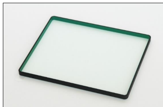
Product photograph of a pellicle