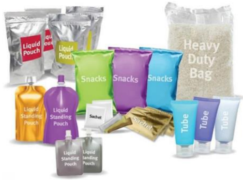
Examples of packaging made using Evolue™