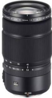
Interchangeable lens for digital camera GFX series “FUJINON LENS GF45-100mmF4 R LM OIS WR”