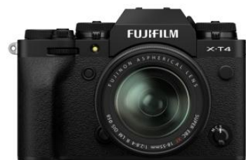
Mirrorless digital camera “FUJIFILM X-T4”