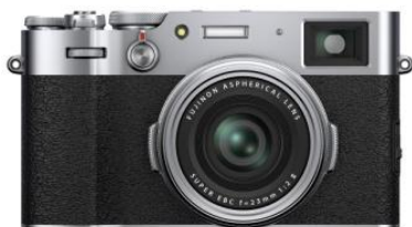
Premium compact digital camera “FUJIFILM X100V”