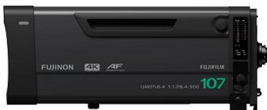
4K-compatible broadcast zoom lens “FUJINON UA107x8.4 BESM AF”