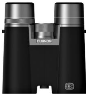
Binoculars “FUJINON HYPER-CLARITY HC8x42/HC10x42” [Good Design Best 100]