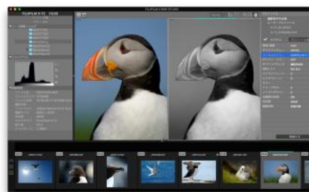
RAW conversion software “FUJIFILM X RAW STUDIO” [Good Design Best 100]