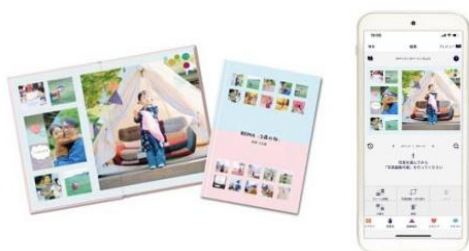
Photobook Service “Year Album”