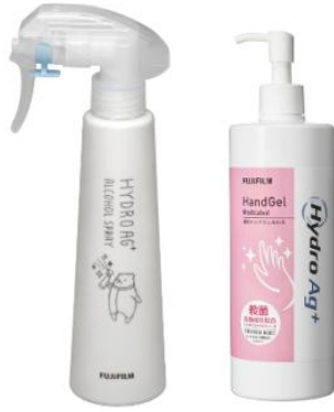
Alcohol spray/Hand sanitizer gel “Hydro Ag+ ALCOHOL SPRAY(60%)/ Medicated Hand Gel HA”