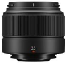
Interchangeable lens for digital camera X series “FUJINON LENS XC35mmF2.0”