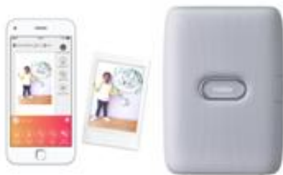
Smartphone app for “instax mini Link”