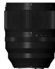
Interchangeable lens for digital camera X series “FUJINON LENS XF50mmF1.0 R WR”