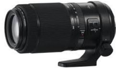
Interchangeable lens for digital camera GFX series “FUJINON LENS GF100-200mmF5.6 R LM OIS WR”