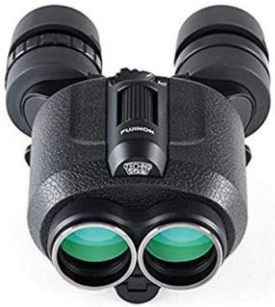
Binoculars “FUJINON TECHNO-STABI TS16X28”