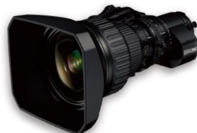
4K-compatible broadcast zoom lens “FUJINON UA24x7.8BERD S6B”