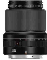
Interchangeable lens for digital camera GFX series “FUJINON LENS GF30mmF3.5 R WR”