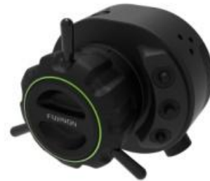
Focus position demand unit “FUJINON EPD-51A-D02/F02” for broadcast lens