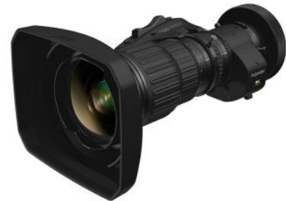
8K-compatible broadcast zoom lens “FUJINON HP12 × 7.6ERD-S9”