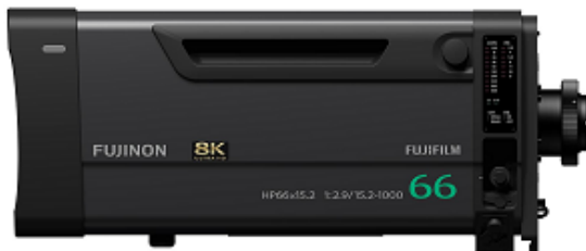
8K-compatible broadcast zoom lens “FUJINON HP66 × 15.2-ESM”