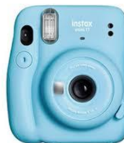
Instant camera “instax mini 11”