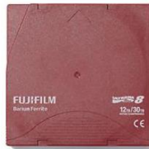
“FUJIFILM LTO Ultrium8 Data Cartridge” [Good Design Best 100]